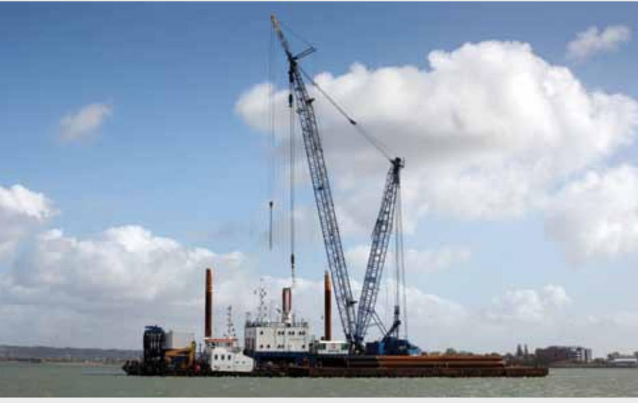
The Dina M carrying out piling works at Portsmouth

The facility has no land connection and so transferring concrete mix can prove to be a logistical challenge, with this in mind VolkerStevin Marine is maximising the use of pre-fabrication and pre-cast methods of construction to minimise the movements required, as the transport over water may influence the concrete.