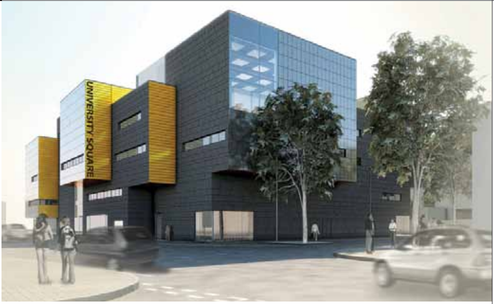
Artists impression of University Square, Stratford