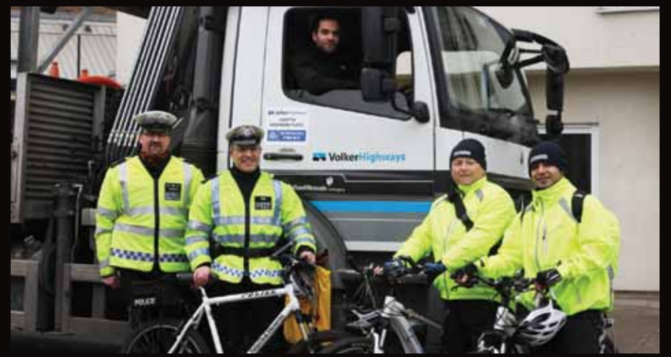
Exchanging places: Met Police and VolkerHighways team