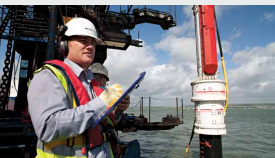
Piling work being undertaken at Portsmouth