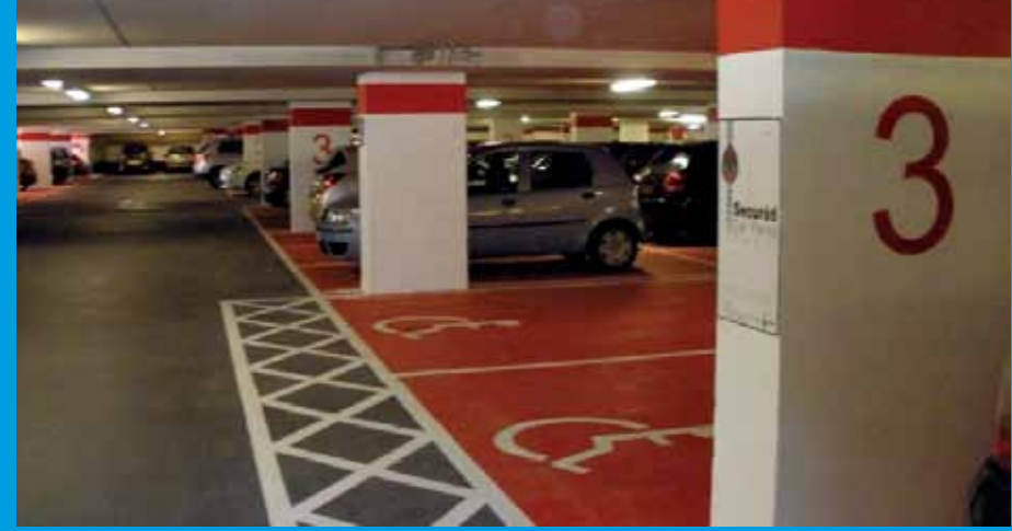
Completed works at Eastgate Shopping Centre car park

The close proximity of the busy shopping centre meant that a large proportion of the works were carried out at night to limit disruption to local residents.