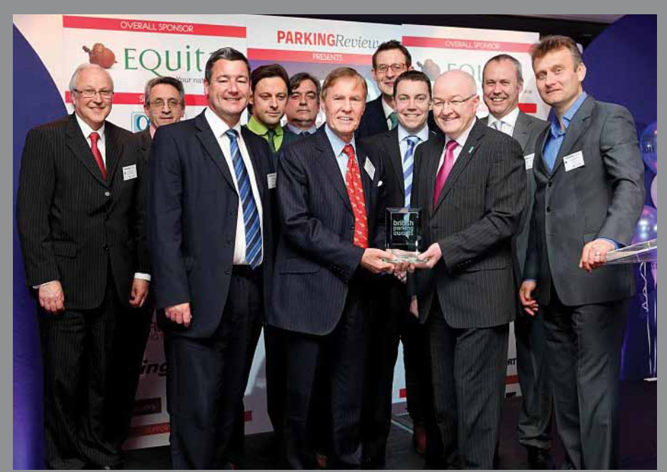
VolkerLaser and Brighton and Hove City Council being presented with the award

The Lanes car park is a 347-space, pay on foot car park which sits in the centre of the city at the heart of the Lanes shopping area. For many visitors, the car park is the front door to the city creating their first and last impressions of Brighton and Hove. The VolkerLaser team worked with Brighton and Hove City Council to transform the car park's look and feel, create a safe and secure environment, improve access links and ensure the car park met sustainable efficiency requirements. The team also helped to develop a distinctive brand and co-ordinate with a new, citywide wayfinding strategy, whilst delivering excellent value for money.