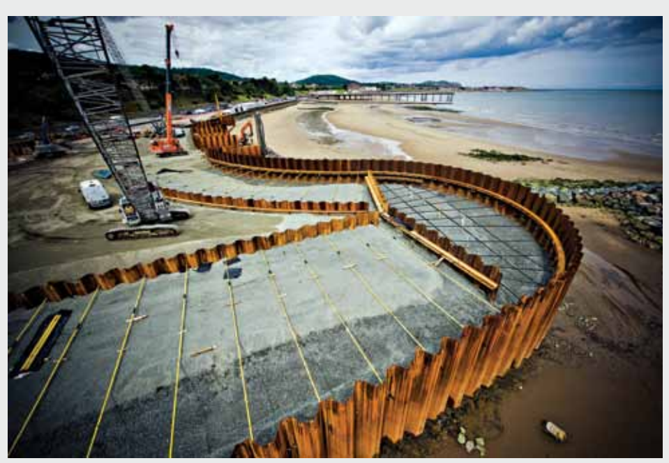
Installation of piling and tie rods at Colwyn Bay

Ian Cussons, VolkerStevin project manager, said: "VolkerStevin is pleased to have been involved in such a transformational project to the coastline of Colwyn Bay. It is estimated that £100m of infrastructure is located behind Colwyn Bay's frontage and so the project has ensured that this infrastructure is now protected from the Irish Sea."