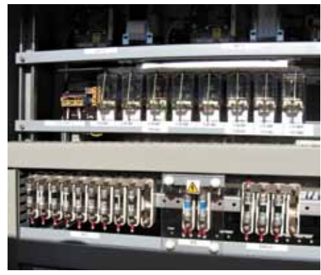
New location case

Services that VolkerRail's SPC Division provides include Signalling and Overhead Line design, installation and commissioning.