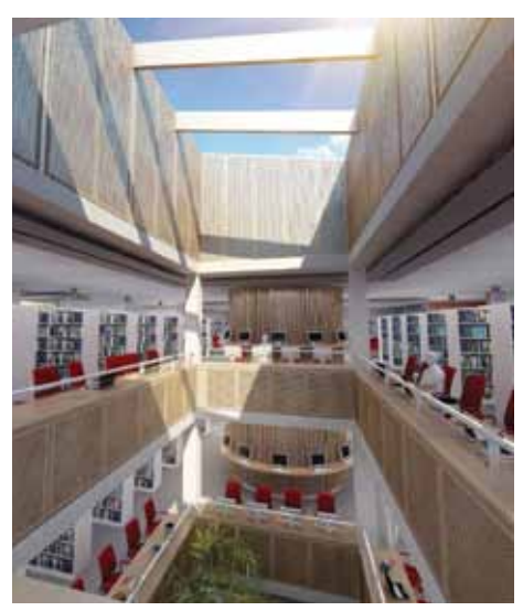
Artists impression of the new Stratford library

Features such as exposed concrete ceilings constructed using a specific shuttering layout, mechanical ventilation, high