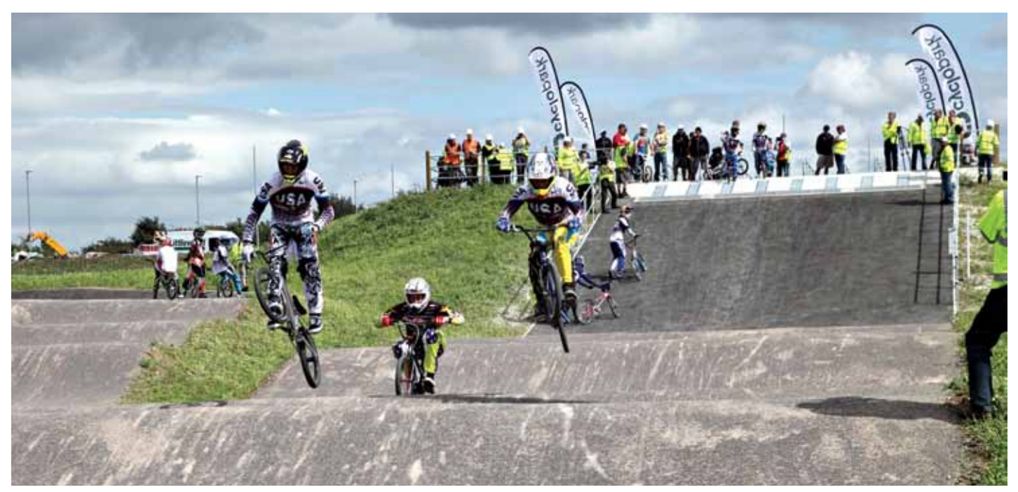
USA Olympic Team trialling the new BMX track at Cyclopark