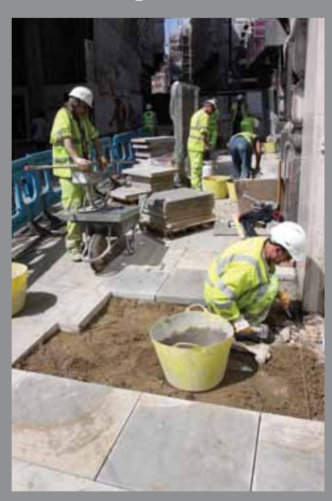
Works taking place at the Quadrant in Piccadilly, London

VolkerHighways is nearing completion at The Quadrant in Piccadilly, London, a £1m project that includes highway improvements and enhancements to the public realm. These works are being carried out concurrently with a larger public realm enhancement scheme set to improve facilities in the Piccadilly area.