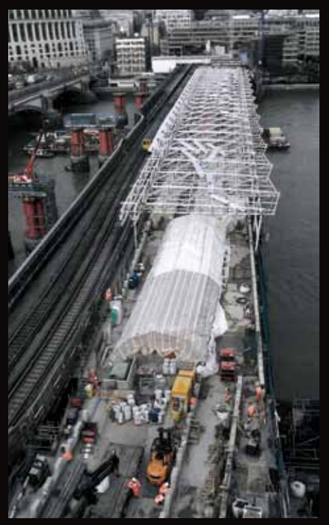
Works taking place on Blackfriars bridge

"The VolkerLaser team continue to work around the clock to achieve the clients key performance indicators. This scheme is an excellent opportunity for VolkerLaser to demonstrate the strength of their specialist construction skills in the waterproofing, strengthening and repair arena."