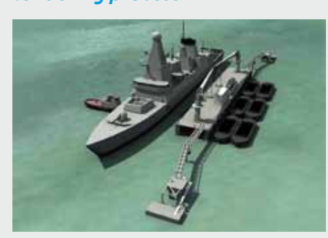
Artists impression of the complete DIO ammunition facility

"DIO's top priority is to support our Armed Forces as they prepare for operations. We are pleased to have awarded the contract to VolkerStevin Marine after a rigorous and competitive tendering process.